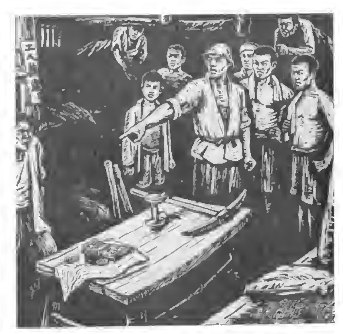
Unmoved by bribes, workers persist in the struggle.